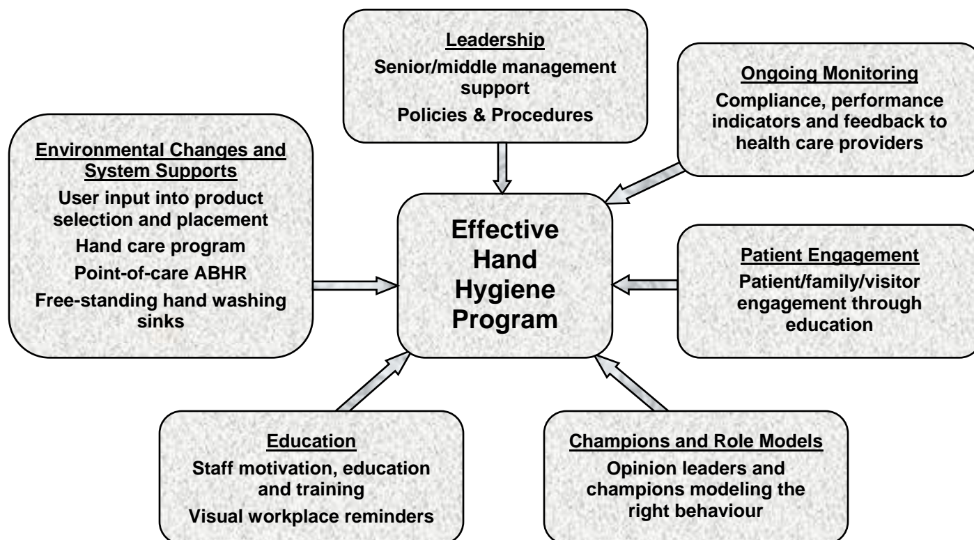
FIGURE 1: Components of a Multifaceted Hand Hygiene Program

An integral part of an effective hand hygiene program is the promotion of hand hygiene by champions and role models 25 within the health care setting. By being role models for best practices, these champions will have a positive influence on their peers.